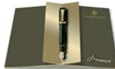
Glorifier may be displayed flat.